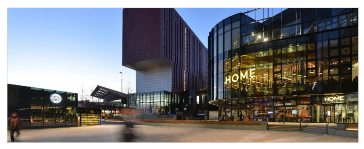
First Street Quarter, Manchester

For more info about the conference please see <a href="https://royalsociety.org/science-events-and-lectures/2023/04/tissue-resilience/">https://royalsociety.org/science-events-and-lectures/2023/04/tissue-resilience/</a>