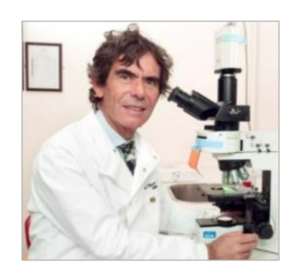
Read the full story

Each day, your heart beats around 100,000 times, pumping about eight pints of blood around your body. By the time you are 20, the heart's function can begin to decline as part of normal ageing. As you get older, activities like running or playing tennis become more difficult. However, some 100-year-olds, like those living in Okinawa, a cluster of islands in southern Japan, appear to have unlocked the secret to a long and healthy life, with some of them seemingly having a heart younger than their age. "It's a combination of a good lifestyle and good genes," explains Professor Paolo Madeddu at the University of Bristol. "And we have discovered that one of these good genes can stop ageing."